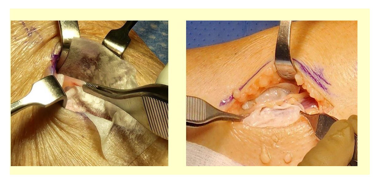
Figure 2. Patient Implants of the NervAlign® Nerve Cuff from the Study.