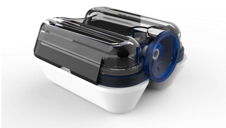
Illustration of the ReNerve tissue treatment kit prototype that allows for the debridement of extracellular tissue, lipids and nucleic materials from autologous tissue during a surgical procedure. The kit can be used to “clean” nerves as well as other tissues like vascular tissue, pericardium and tendons in theatre prior to being implanted with an aim to speed patient recover and result in better post-surgery outcomes for patients.

ReNerve continues to develop the design of a tissue treatment kit. Recent results from using the treatment process clearly show a debridement and cleaning of tissue is possible within 20 minutes in a surgical theater setting. ReNerve continues to work with designers to perfect a kit prototype that is both effective and inexpensive to manufacture and supply.